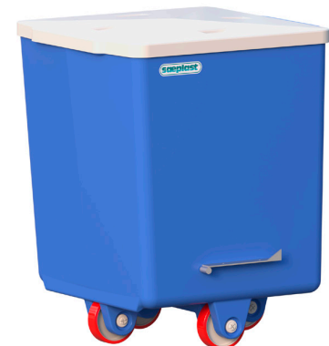
Both Sæplast PE MS300 and MS301 are available with lid