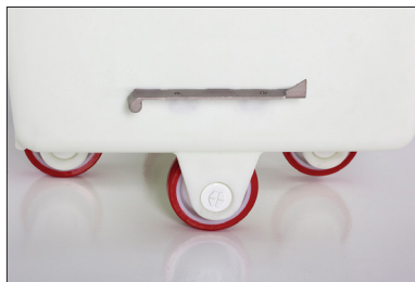
Integrated stainless steel brackets.