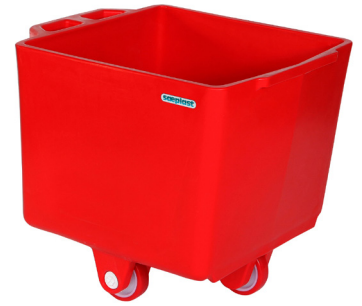
PE CONTAINERS Sæplast MS201 Buggy without bracket