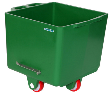
PE CONTAINERS Sæplast MS200 Buggy with bracket