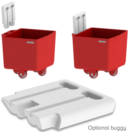
Optional buggy handle available