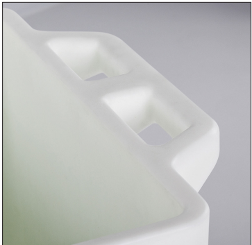
Ergonomically designed handles.