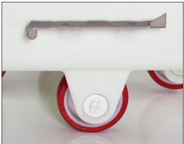
Integrated stainless steel brackets.