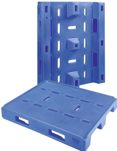
DP40R (with edges)