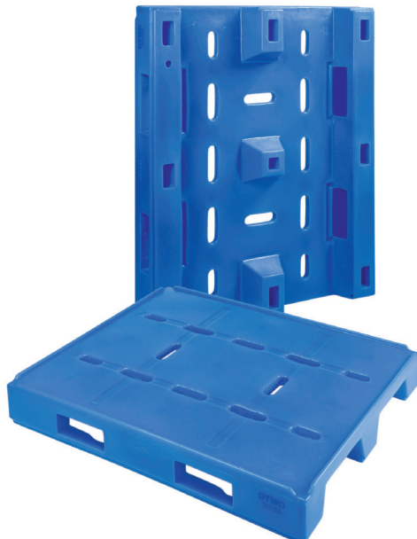
DP40R (with edges)