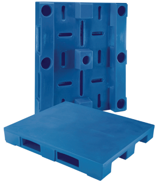
DP40F (flat top)